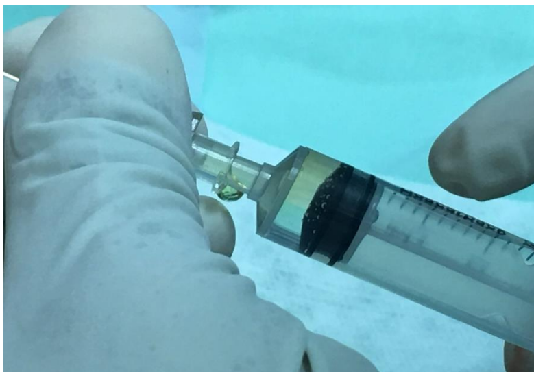
Figure 2: Photo of the patient with xanthochromic CSF in the 2 nd puncture.

cutting needle and hyperbaric 12.5 mg bupivacaine was injected again, with return of CSF xanthochrome aspect ( Figure 2 ), and both sensory and motor blocks were installed, and the patient was released for the proposed surgery. No adjuvant was used in both spinal anesthesia.