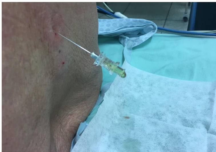
Figure 1: Photo of the patient with xanthochromic CSF in the 1 st puncture.

After 10 minutes, neither analgesia below the puncture level nor any degree of motor block in the lower limbs were observed, having been considered blocking failure. A new asepsis and antisepsis procedure was performed in the sitting position, with puncture between L3-L4 with a 27G